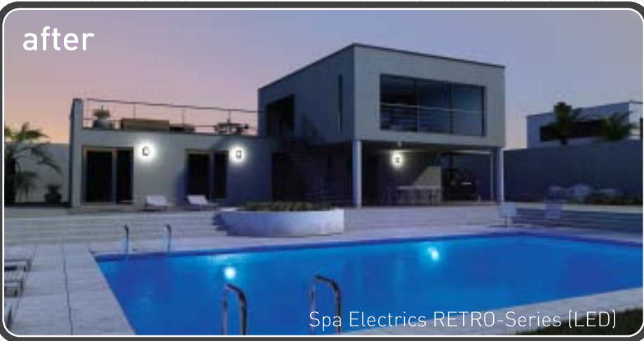
Spa Electrics RETRO-Series (LED)

Utilising advanced Ceramic Light Engine Technology, the RETRO-Series boasts greater illumination than a 100W halogen Light while consuming less than 12watts of energy! Saving you money and reducing carbon emissions by up to 90%